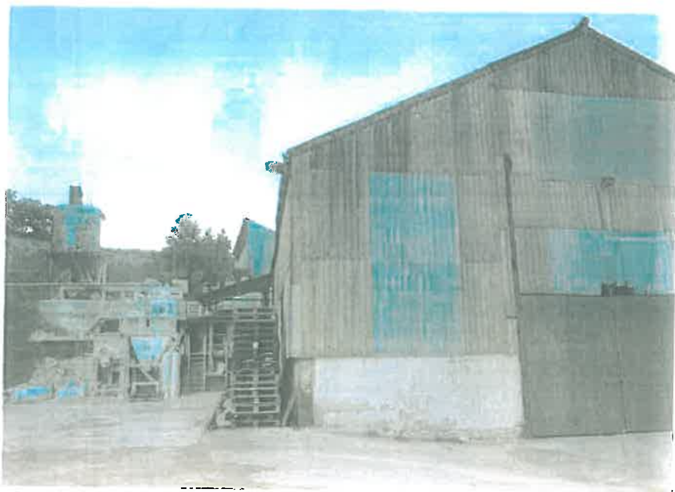
Photograph 2: Front elevation from the southwest showing the production building