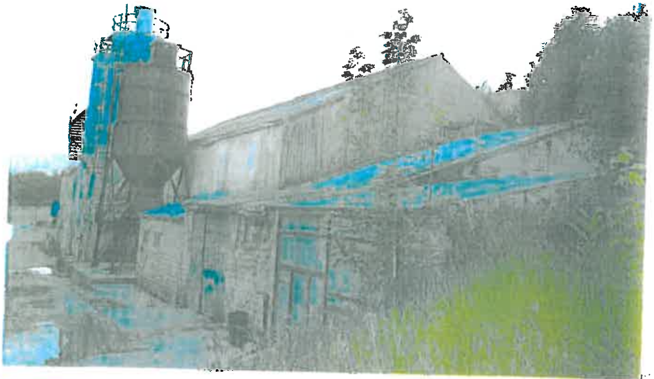
Photograph 3: Front elevation from the north-east showing the production building and powder silos.