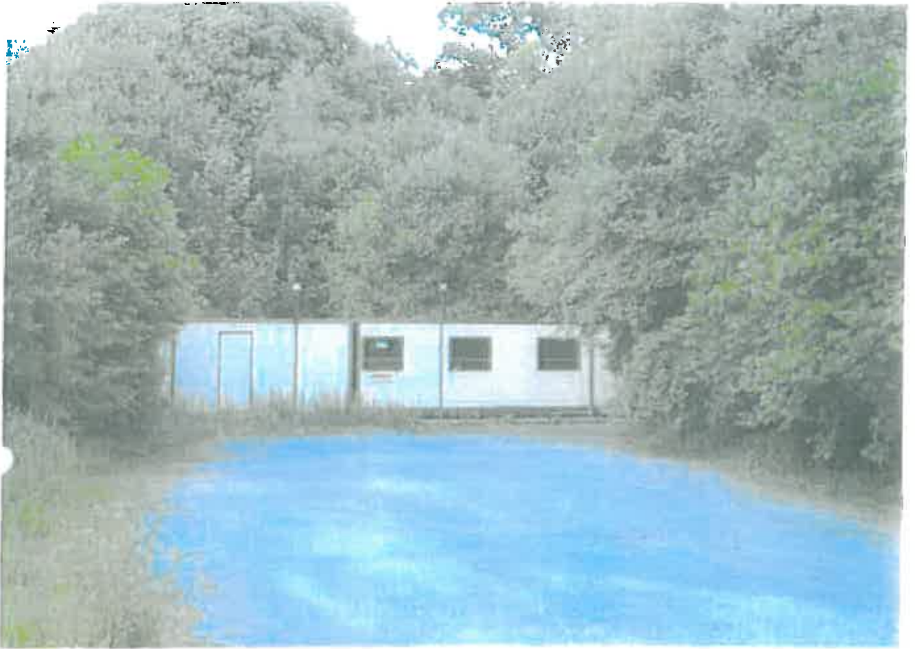
Photograph 5: Company offices and car parking area...