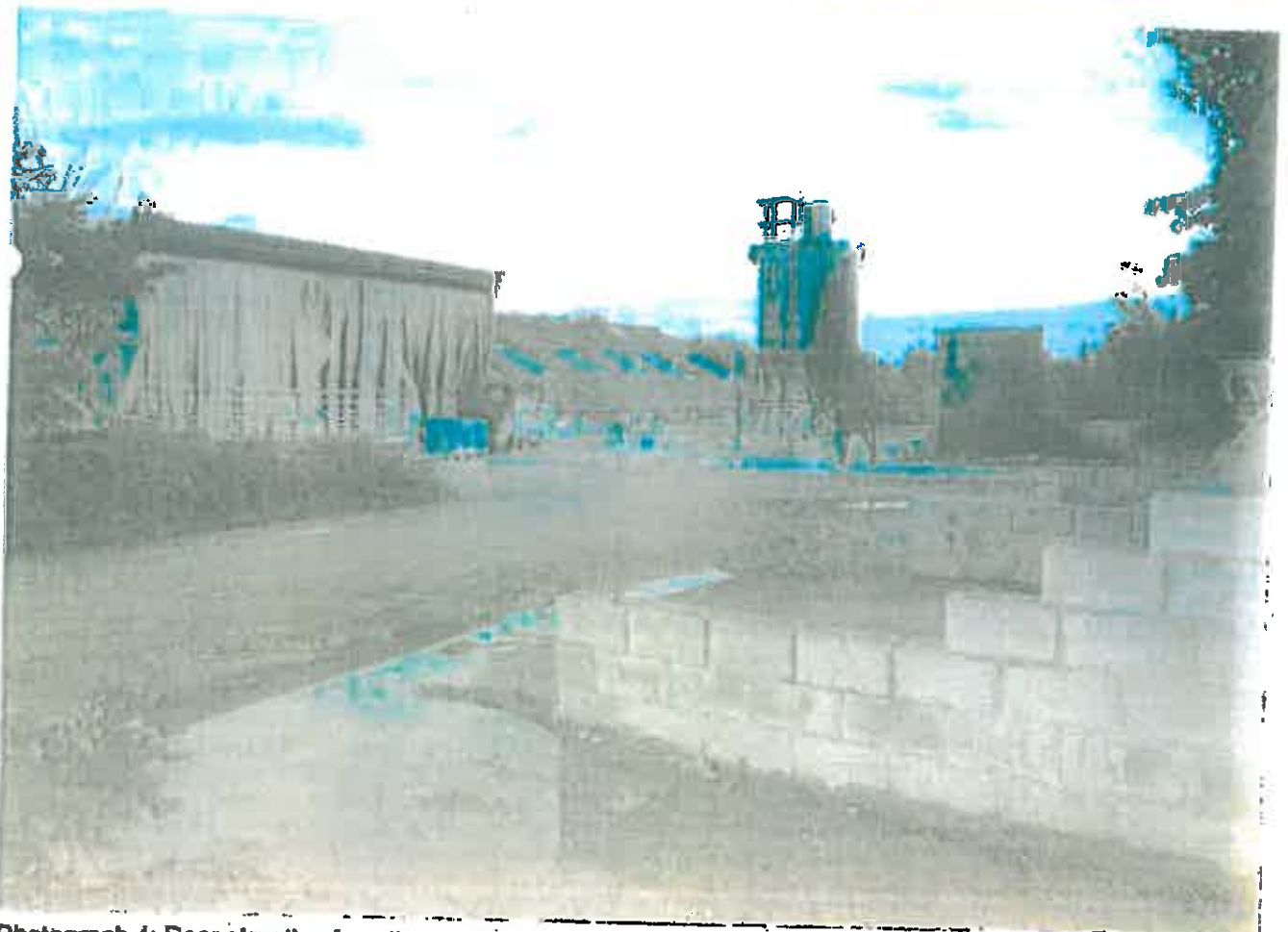
Photograph 4: Rear elevation from the north-east showing the production building, aggregate storage areas and off-loading dock.